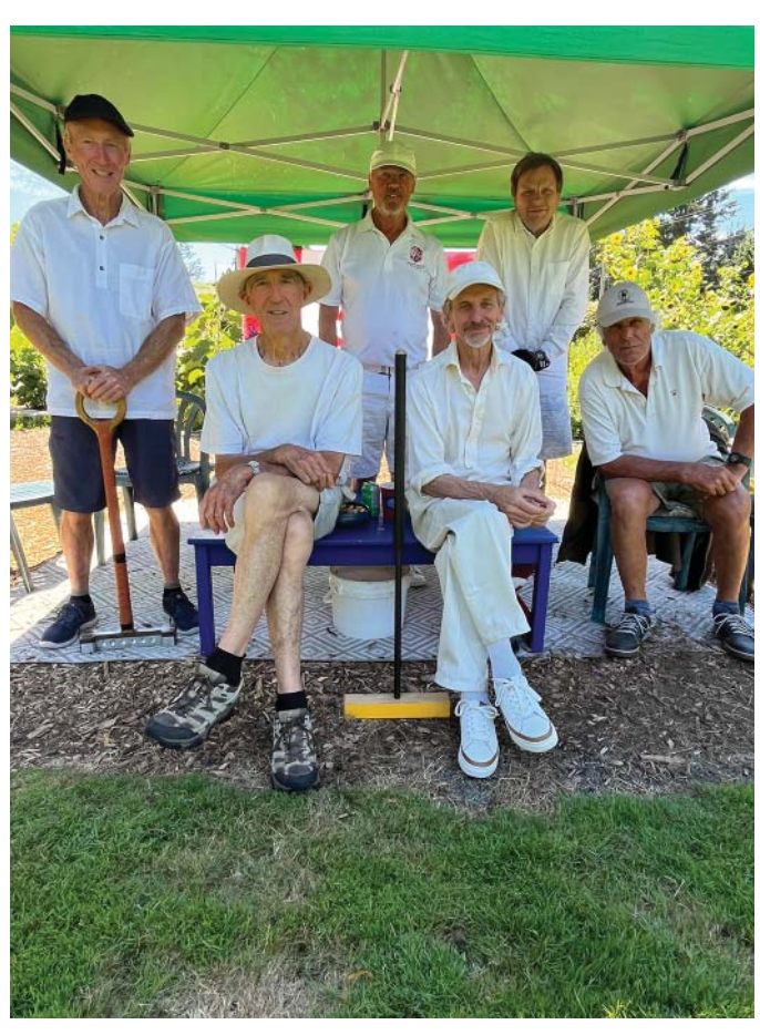
B&C Flight Event group