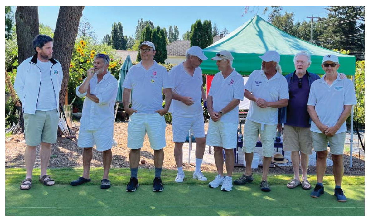
Happy Valley Eight group